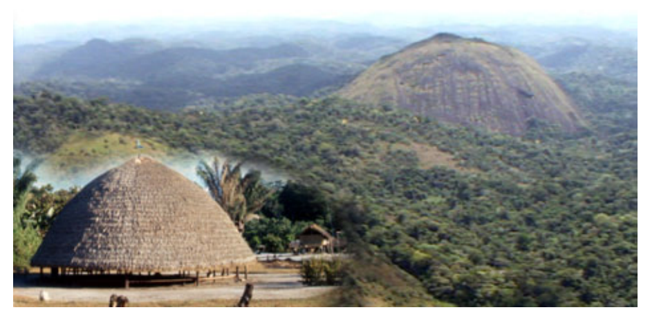
Figure 3 – T1 ("Mount Tukusipan") resembling a Wayana community roundhouse ( tuku-sipan ).

According to the Wayana, who live in keeping with the "law of resemblance" (Ahlbrinck 1937), Mount Tchoukouchipann was not 'Mount Tukusipan,' as it did not resemble a tukusipan (community roundhouse). The 2004 expedition continued towards the next inselberg, unlabeled on the map and therefore referred to as "T1" (first inselberg next to Tchoukouchipann). T1, according to the Wayana, is the "real" mount Tukusipan, because it does resemble a tukusipan, a community roundhouse when seen from the south (Figure 3). This inselberg is also known as Timotakem ("with a shoulder"), as it does resemble a shoulder (mota) when viewed from the east. Moreover, archaeological material was recovered on the forested summit (Duin 2006b)<sup>15</sup>. Albeit inselbergs in this region often illustrate the pristine nature of the Amazonian rainforest, our combined efforts argue that this landscape is a cultural landscape and a "mythscape" at the heart of