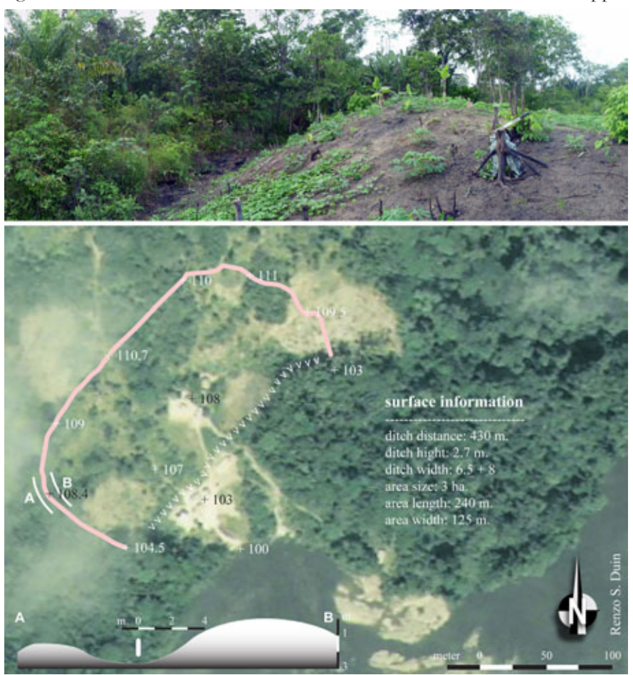
Figure 4 – Ditch or moat (mapped by GPS) encircling the current indigenous Wayana village of Kumakahpan. Top: A-B section viewed from the southeast.

-burn garden revealed a ditch or moat measuring over six meters in width (the earth removed was used to build a bulwark), and about three meters between the lowest point of the ditch and highest point of the bulwark (Figure 4, top). Thick undergrowth and bamboo patches block the view over the remainder of the ditch. During the past decennia, inhabitants of Kumakahpan were aware of this ditch, but it had never been mapped.