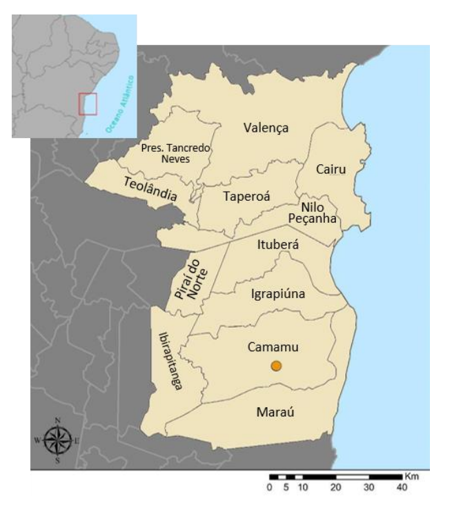
Figure 1. Map showing the location of the Southern Bahia Lowlands region, Brazil, and the data collection site (yellow dot).

The research was carried out in the Southern Lowlands of the State of Bahia, located in the Northeast region of Brazil (Figure 1). This region covers an area of 6,451 km<sup>2</sup>, being home to 2.08% of the population of Bahia (BRITO, 2007). The territory covers 14 municipalities, including Camamu, where the researched community is located.