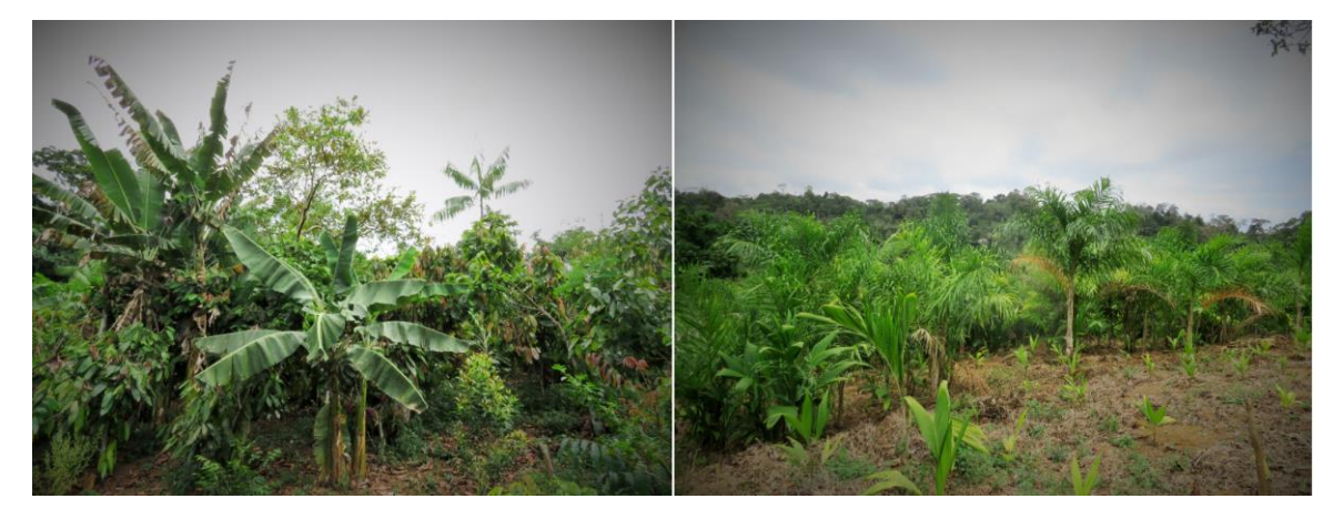
Figure 2. images of the forestry agroecosystems (AF) on the left, and the conventional one on the right, studied in the Dandara dos Palmares settlement, Bahia, Brazil.