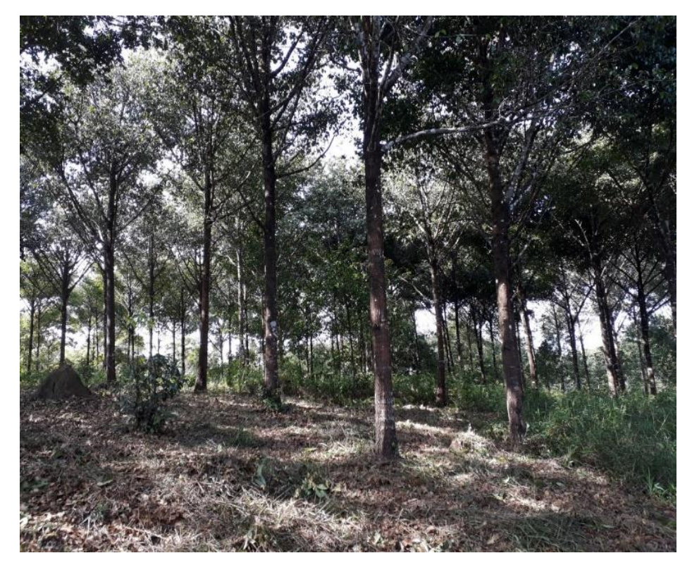
Figure 2 . Management of bacuri trees carried out by producers in the municipality of Maracanã, North-eastern Pará.

The questionnaire addressed general topics regarding the family and the establishment, and also focused on the management of bacuri trees (Figure 2) and the relationship with other agricultural activities.