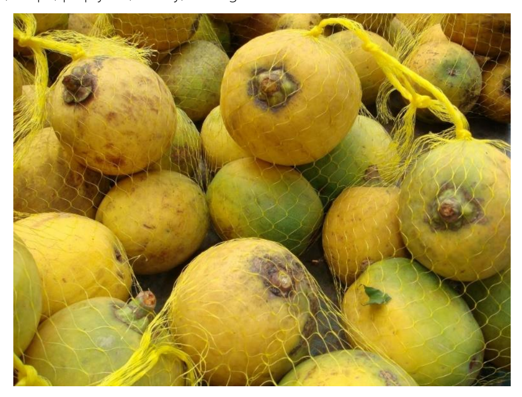
Figure 3. Bacuri fruit is collected only after they have fallen. There are variations in color, shape, pulp yield, acidity, among other attributes.

From the socioeconomic survey conducted in the mesoregions of North-eastern Pará and Marajó, the most relevant data were analyzed, which enabled a profile to be generated of farmers who manage bacuri trees and who commercialize the bacuri fruit or pulp in one way of another (Figure 3).